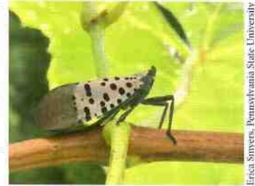
Profile of adult SLF on grape