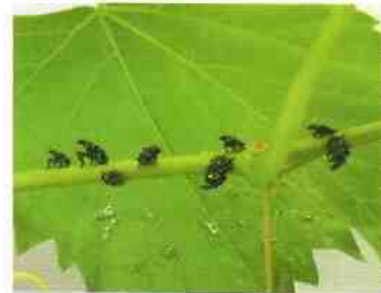
Early instar nymphs (1st through 3rd) feeding on grape

with a white band. The abdomen is yellow with black bands down the center. Third and fourth instars and adults migrate to tree of heaven as a preferred host. Adults mate in late summer to early fall in Pennsylvania and form large congregations. Although these have been observed on grapevine, willow, maple, and other tree species, they most commonly occur on tree of heaven. Females lay eggs from late September through October and dozens of egg masses can be found near adult aggregations. Eggs are deposited on tree trunks, limbs, and loose bark as well as any smooth surface, including stone, vehicles, trash barrels, outdoor furniture, and other man-made structures. Newly laid egg masses have a gray, mud-like covering, which can become dry and cracked over time. Old egg masses appear as four to seven columns of seed-like eggs, 30-50 eggs in total, approximately one inch long.