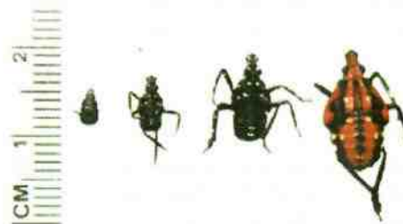
Four nymphal instars of L. delicatula