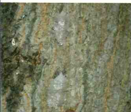
Egg masses of L. delicatula covered by waxy deposits